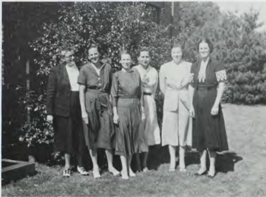
25th reunion for the class of 1927