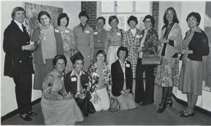
The Class of 1953 - 20th reunion: